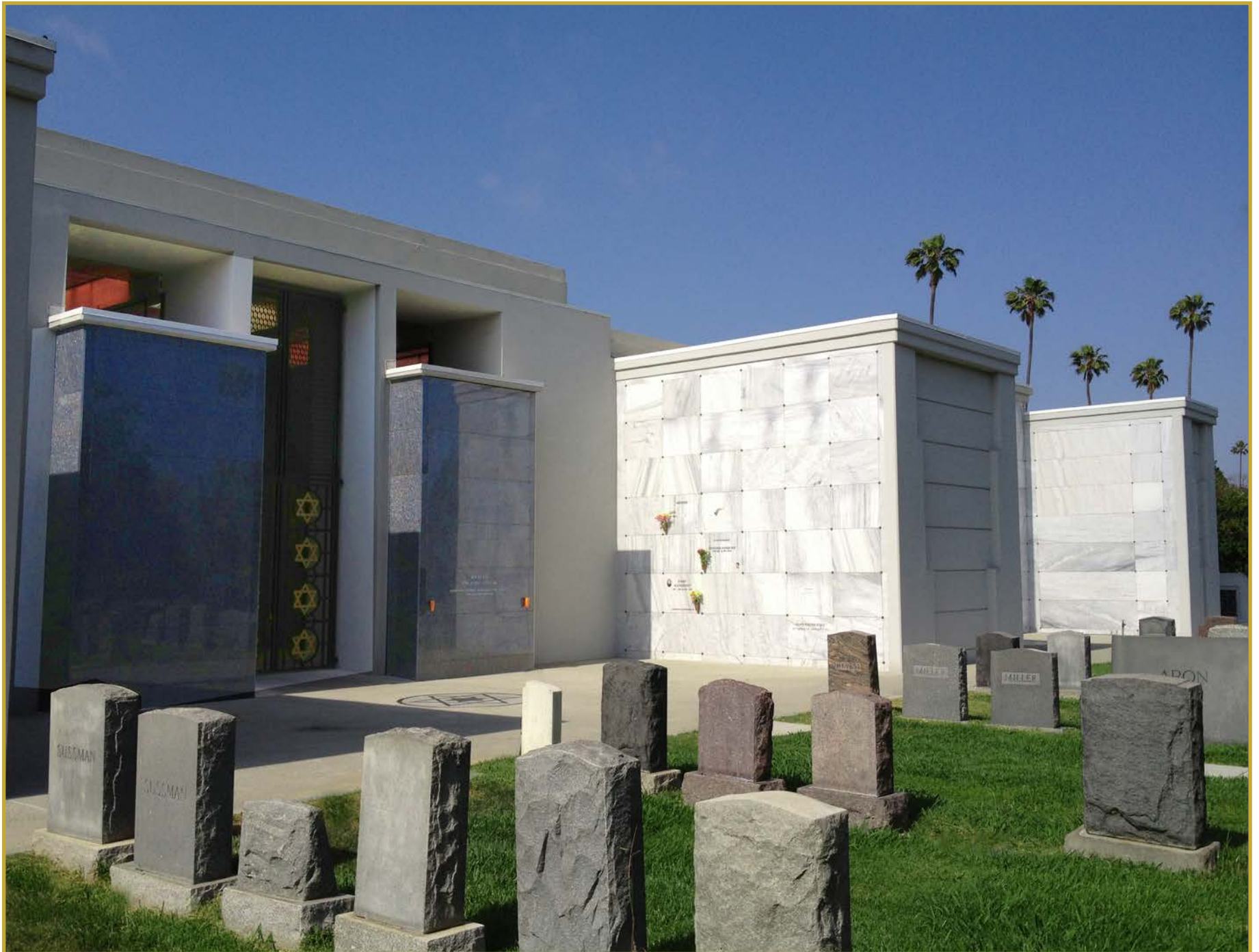
HALL OF DAVID MAUSOLEUM