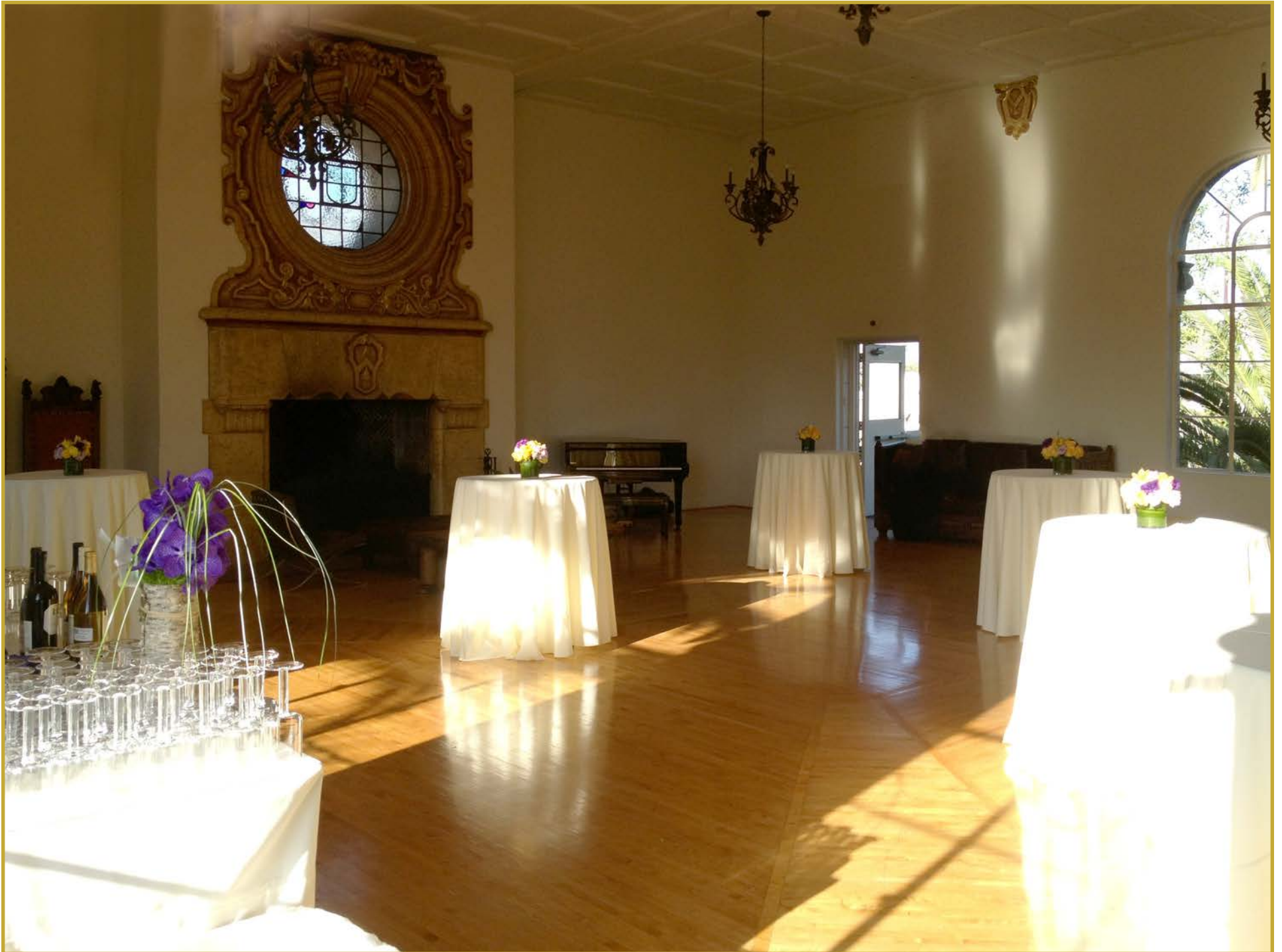
EASTERN STAR ROOM