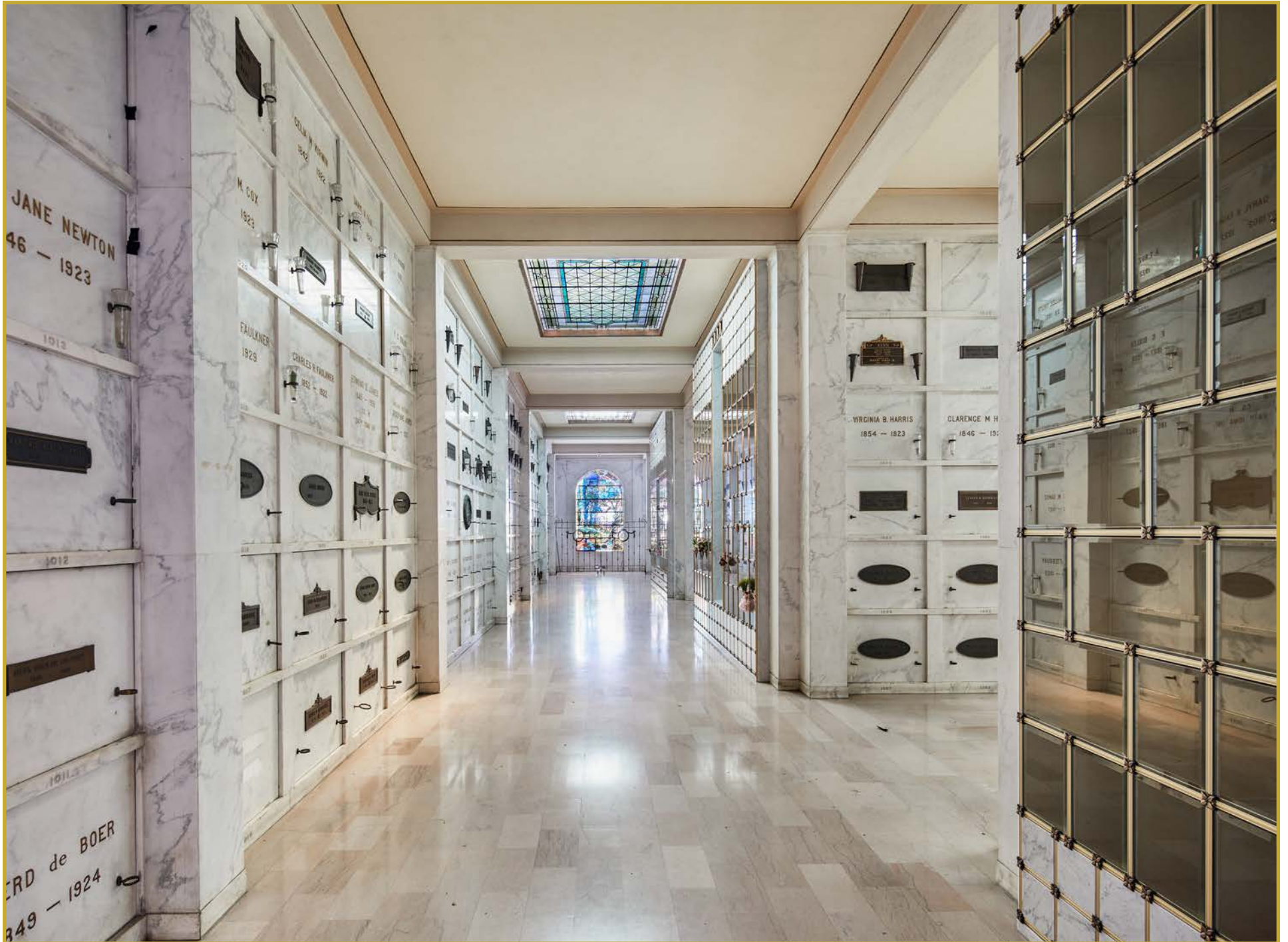
VALENTINO SHRINE CREMATION NICHES