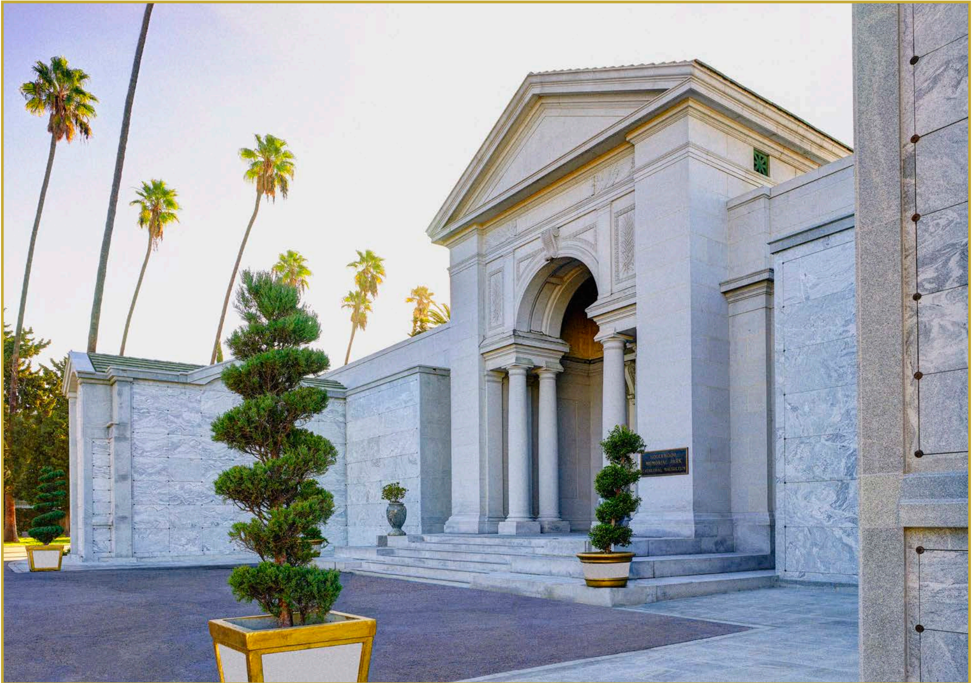
HOLLYWOOD CATHEDRAL MAUSOLEUM