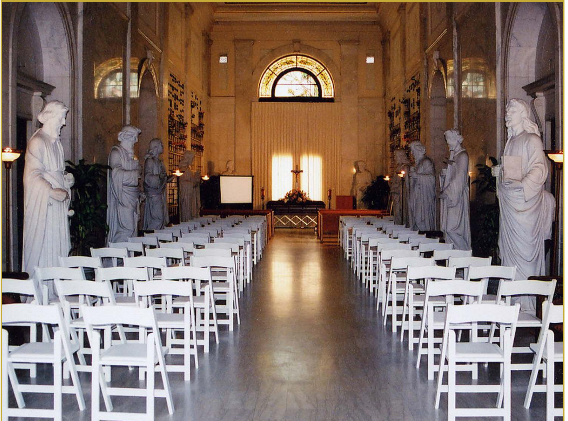
HOLLYWOOD CATHEDRAL MAUSOLEUM