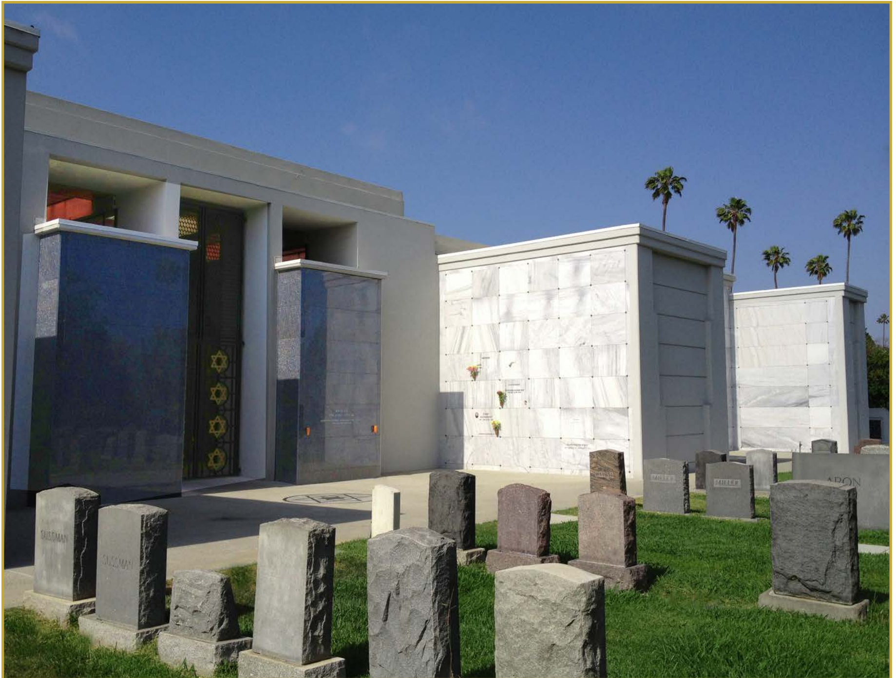
HALL OF DAVID MAUSOLEUM