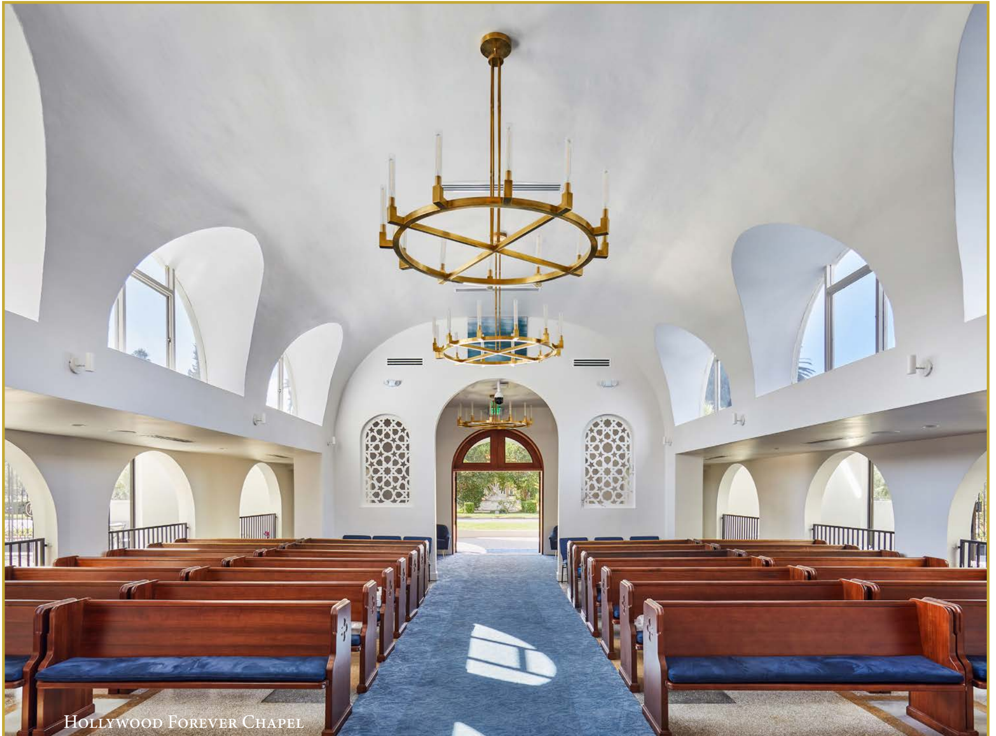
HOLLYWOOD FOREVER CHAPEL