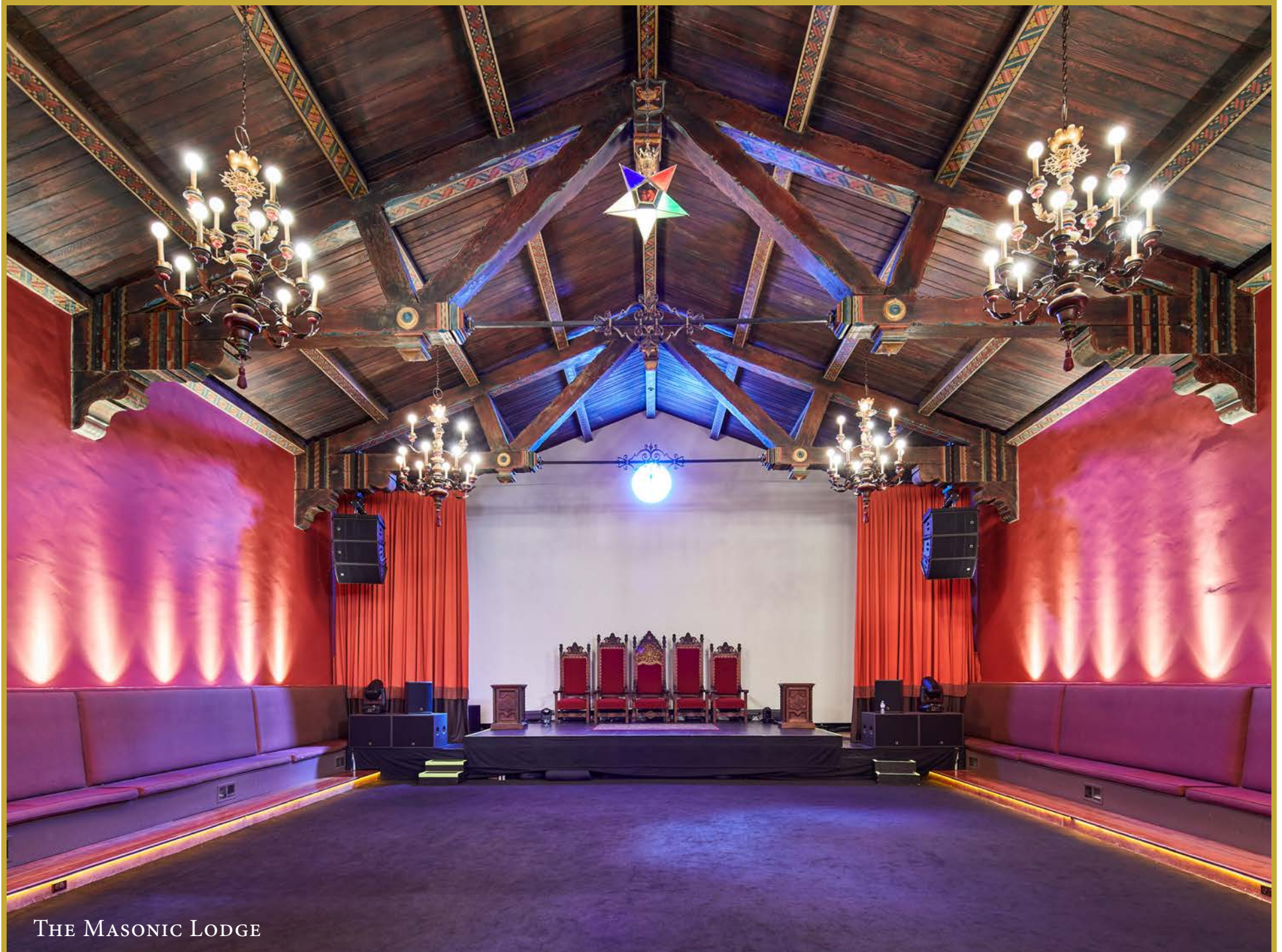
THE MASONIC LODGE